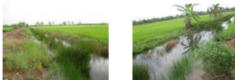
Figure 2. Water condition at tertiary channel as results of rain water detention

The study area can not receive high tidal water so that gravitational irrigation can not be implemented. Therefore, crop water requirement is mostly from rainfall water supply and capillary movement within soil. Water management system resembles rainfed rice. Criteria for actual land suitability are not suitable for rice crop, but it can be changed by changing of planting season and management. Suitability class could be only S1 (Highly Suitable) if rice is planted in November and harvested in February. This condition should be accompanied by water retention effort in tertiary channel by closing tertiary channel gate so that rainfall water can be stored, i.e. long storage concept. Full water condition in this channel will decrease percolation rate and even zero percolation so that rainfall water can be stored in land for 3 months planting season period and land was flooded (Figure 2). Good rice growth can be achieved at this condition.