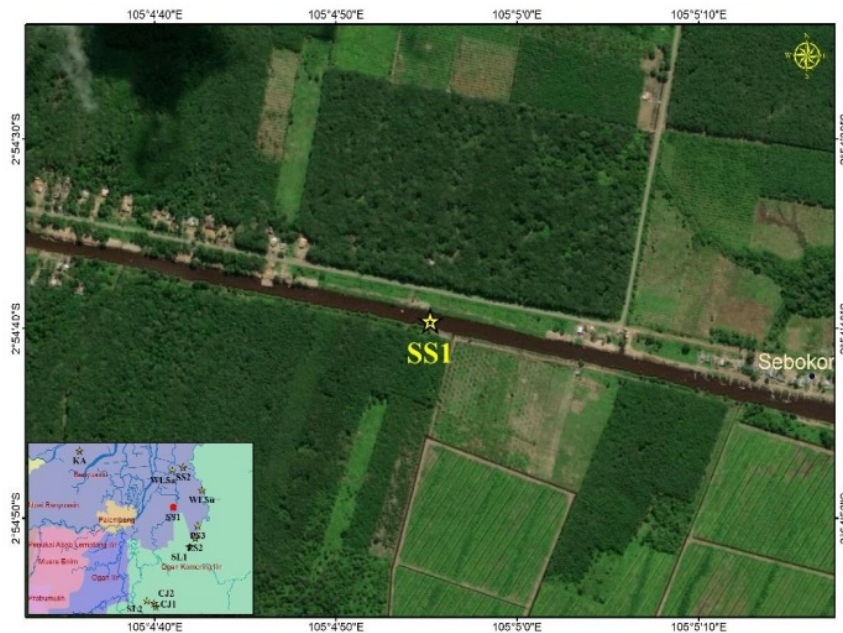
Figure 3. Map of SS1 station