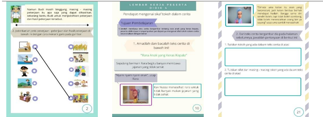
*e-student worksheet uses the Indonesia language because it is used in Indonesia