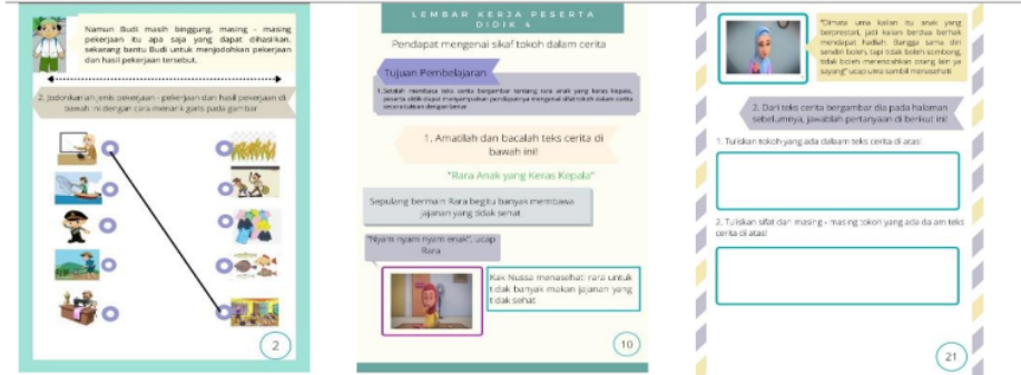
*e-student worksheet uses the Indonesia language because it is used in Indonesia