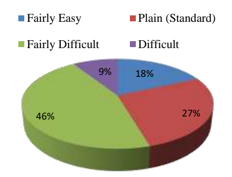
Figure 1. Readability Category of Reading Text of Interlanguage English Textbook

It is noticed from the figure that 46% of the reading texts are categorized as fairly difficult. This means the textbook is appropriate for school grades 10-12 which require reading ease scores between 50.0 and 60.0. The next figure also provides the level of cognitive domain of the reading comprehension questions of the textbook.