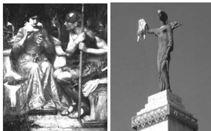
Figure 1. John William Waterhouse's painting "Jason and Medea" (1907)

Medea's skills are revealed in the myth about the Argonauts. Facts say that Jason arrived from Iolcus to Colchis (the old kingdom of Georgia) to claim his inheritance and throne by retrieving the Golden Fleece. In the most complete surviving account, the Argonautica of Apollonius, Medea fell in love with him and promised to help him but only on the condition that if he succeeded, he would take her with him and marry her. Jason agreed. In a familiar mythic motif, Aeëtes promised to give him the fleece but only if he could perform certain tasks. First, Jason had to plough a field with fire-breathing oxen that he had to yoke himself. Medea gave him an unguent with which to anoint himself and his weapons, to protect him from the bulls' fiery breath.