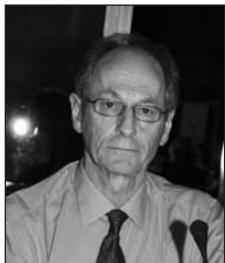
Sir Michael Marmot