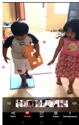
Figure 2. A video recording of the sibling fighting

English, and it is easier for the children to acquire Indonesian when they acquired English first.