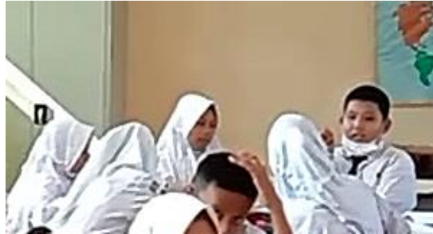
Picture 2. Student's collaboration

Then in core activity, the model teacher divided students into seven groups with heterogeneous abilities, gave them an explanation about the lesson. After that, teacher gave students worksheets: the first was the sharing task and the second was jumping task. In the beginning, all students did the question individually. The researcher focused on observing one student. The result showed the student with initial N was very enthusiastic and followed the lesson well even when looking at the pictures on the slide about kind of traditional food from Palembang. After that, he often leaned his body into a chair, held his head and sometimes unfocused because he was busy with his activities. The teacher always controlled each group. When in N's group, the teacher gave suggestions them to asked friends "please teach me" but the N did not pay attention to the teacher, but he covered his face with his hands. After the teacher left, then the N asked his friend. Then, in jumping task, N had many discussions with his friends. In this focus group, the collaboration among students run well. Students in groups did not ignore the members of the group who had difficulty in answering the questions. It is supported the statement from Vygotsky (1978), the collaboration of students and experts on real-world problems or tasks that were built on the language, skills, and experiences of each person formed by each individual's culture in the social context.