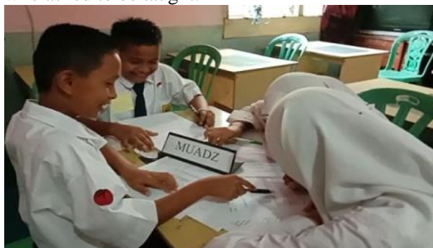
Picture 1. Student's collaboration

immediately explained to him. After understood, the students read the question and then he tried to answer the question by himself without asking his friends. The collaboration among students began during when the activities of jumping tasks and the teacher occasionally controlled them to ensure they could work on the questions and still gave them instructions to help each other if there were friends who asked to be taught.