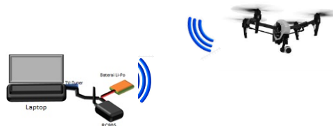
Figure 2. Mechanism of hardware design

This section will design the hardware system to determine the characteristics, data retrieval and processing of sensor data. The environmental data such as fire image data. Wi-Fi digital camera will capture image of the field as environmental information. The data will be sent to laptop to process through tv tuner, the data will send to laptop or pc. By using camera image data processing application, it will get the result of environment image submitted. There are two components of tool that use for the image data transmission from air to ground station, the air component is a carried tool by quadcopter on the air and the land component is a tool used in ground station. Air components are digital camera and video transmitter. While the land components are video receiver, tv tuner and laptop. The captured image data by camera transmitted as video.