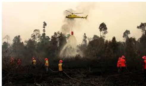
Figure 1. Land Fire

Indonesia has the largest agricultural land among tropical countries, which is about 21 million hectares scattered mainly in Sumatera, Kalimantan and Papua (BB Litbang SDLP, 2008). Damage of land and shrubs ecosystems have a major impact on the local environment (in situ) and its surroundings (ex situ). Flood in watershed downstream is one of the impacts the damage of land and shrubs ecosystems. Deforestation and land use on an agricultural system that requires deep drainage (>30cm) and burning or fire cause CO 2 emissions become extremely high [1]. Forest fire monitoring can be done using satellite image or unmanned aerial vehicle (UAV) with image processing applications. Figure 1 below is monitoring of bush and peat land fires