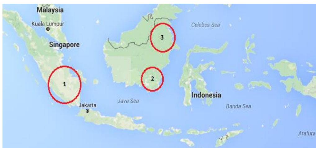
Fig 1. Several regions that are producing the amount of thermal Coal.

Indonesia knows as an exporter of thermal coal that consists of medium quality (5100-6100 Cal/gram) as well as low-quality (<5100 Cal/Gram). This Thermal Coal has large demand imported by China and India. Based on the latest data from the Geological Agency of the Ministry of Energy and Mineral Resources (ESDM), Indonesia's coal reserves reached 26.2 billion tons with coal production of 461 million tons last year, the life of coal reserves is still 56 years if it is assumed that there are no new reserves [1]. There are three regions in Indonesia that are producing thermal Coal, which are South Sumatera, East Kalimantan and South Kalimantan (Fig. 1). However, there is numerous smaller mine of coal that digging in the island of Kalimantan, Sulawesi, Sumatra, Java, and Papua.