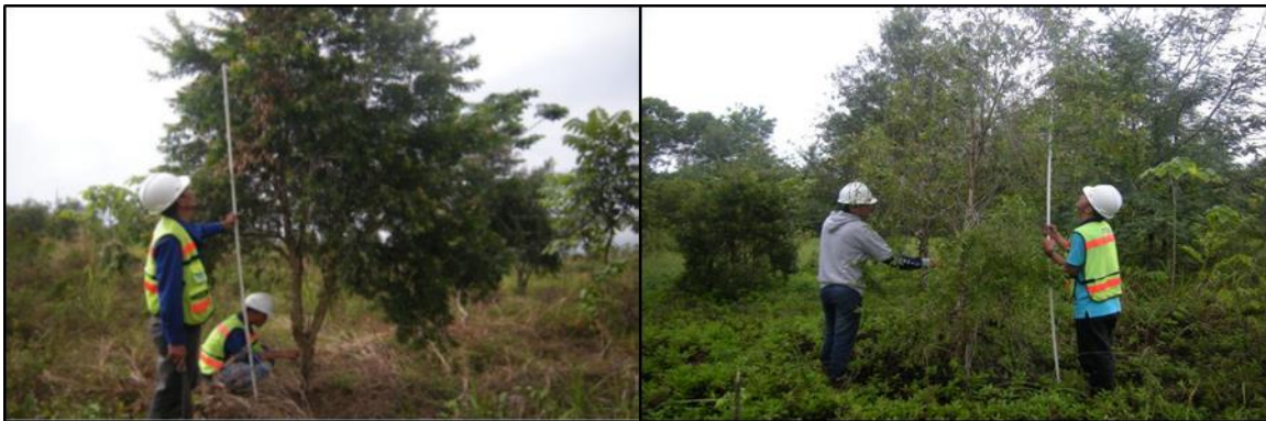
Fig.2. Measuring Height of the planted tree in post-mined land

Some of the valuation indicators in biodiversity recovery are width and layer measurement of the canopy at the certain age. These indicators are only regulated in ESDM Decree No 7/2014. Currently, the tree measurement procedures (width, height, and layers of canopy) are carried out manually by human/officer as shown in Fig.2. This manual measurement is not accurate especially for areas with hills or landslide and time-consuming. The shortcomings of manual tree's measurement can be overcome by our methods of aerial photographs using a drone.