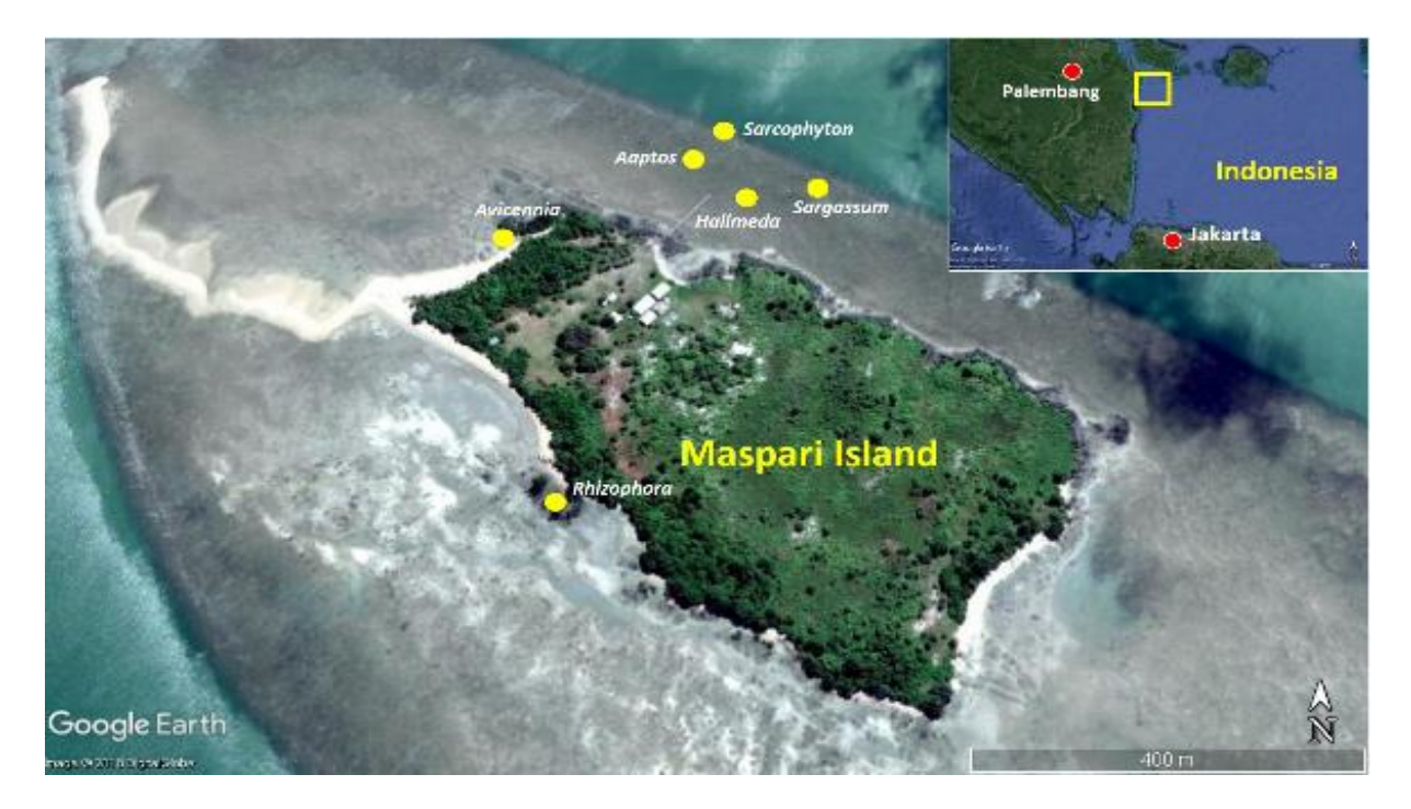
Figure 1. Sampling location of marine biota.

Bacteria isolates used for the test were six isolates of Vibrio sp. (with code V. spp1 to spp6), isolates were isolated from Vannamei sp. shrimp ponds at shrimp farming location in Sungsang, South Sumatera. In addition, the performance is also tested on the bacteria S. aureus and E. coli using Nutrient Broth (NB) and Nutrient Agar (NA) growing media. Inhibition test is done with agar diffusion (10.000 ppm for extract concentration). The extracts were tested using paper disks and solvents as controls with repeated three times (Rozirwan et al., 2015).