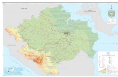
Fig 2. Palembang and Semende area with white line border

The Palembang area's target population was 206 junior high schools and 201 senior high schools/vocational schools, both public and private schools in modern city living. Meanwhile, Semende only consists of three sub-districts with 14 junior high schools and three senior high schools/vocational schools in rural area. There is no data obtained on the number of students at DAPODIKNAS (the official website of the Ministry of Education and Culture of the Republic of Indonesia).