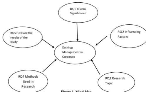
Figure 1. Mind Map