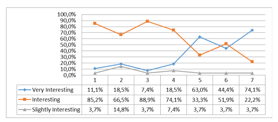
Figure 1: The relationship between duties, materials, and exercises in understanding and performing Dulmuluk performing arts.

(Indonesian traditional verses). In conclusion, the lecturers really needed a Dulmuluk performance module.