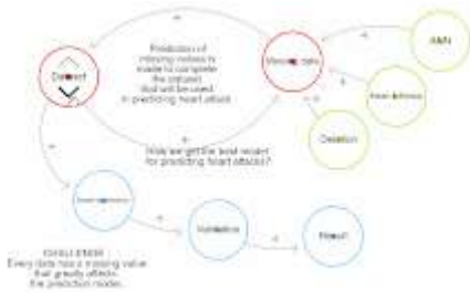
Graphical Abstract.gif 4571K