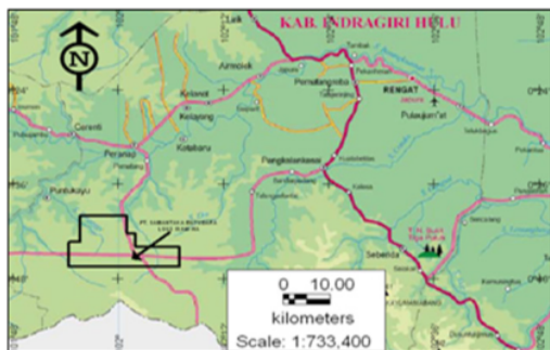
Figure 1. Map Location of PT. Samantaka Batubara [3]

anap Sub-district (Punti Kayu Village), Rakit Kulim Sub-District (Talang Durian Cacar Village) INHU Regency of Riau Province. Delivery of the territory can be reached by road from Pekanbaru City towards Peranap through the East Cross Road Sumatra with a distance of approximately 200 Km or travel for approximately 4 hours using the Four Wheel vehicle with paved road conditions. The location of research is shown in Figure 1.