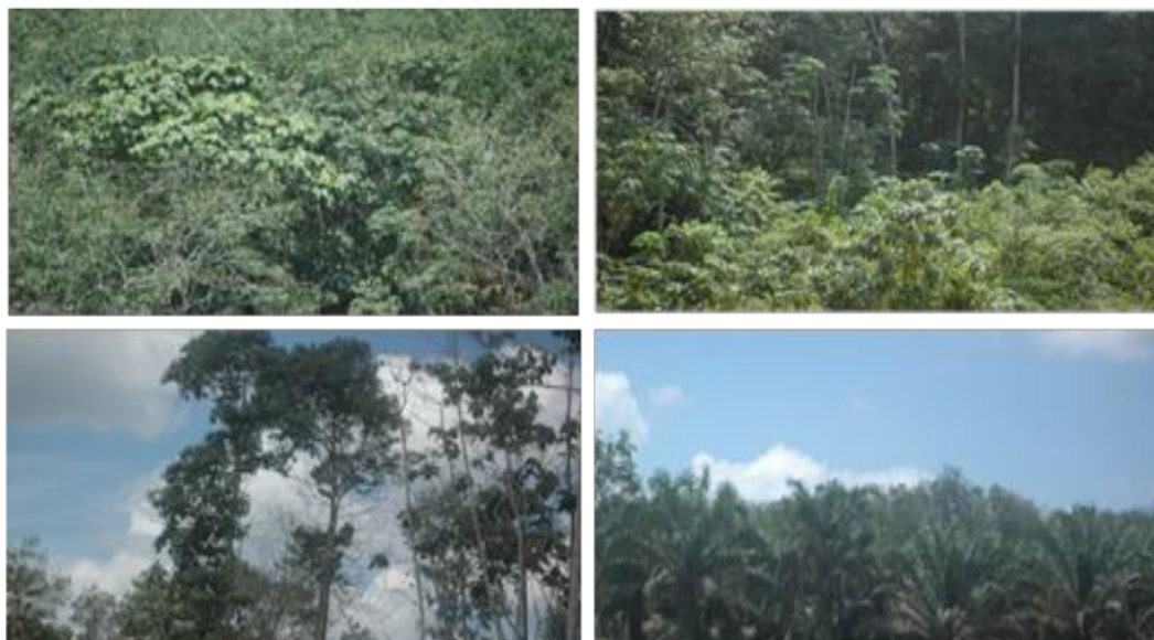
Figure 2. Uninterrupted Area, Disturbed Land, Reforestation and Other Utilization of Mined Land

Coal mining planning is aims to technically design coal mining activities such as mining methods, mining systems, mining design and mine life. Based on these matters, it can be planned for post-mining land plots. The method used in PT Samantaka Batubara open pit (surface mine) with open cast mining system [7]. This selection is based on characteristics of available coal depos-